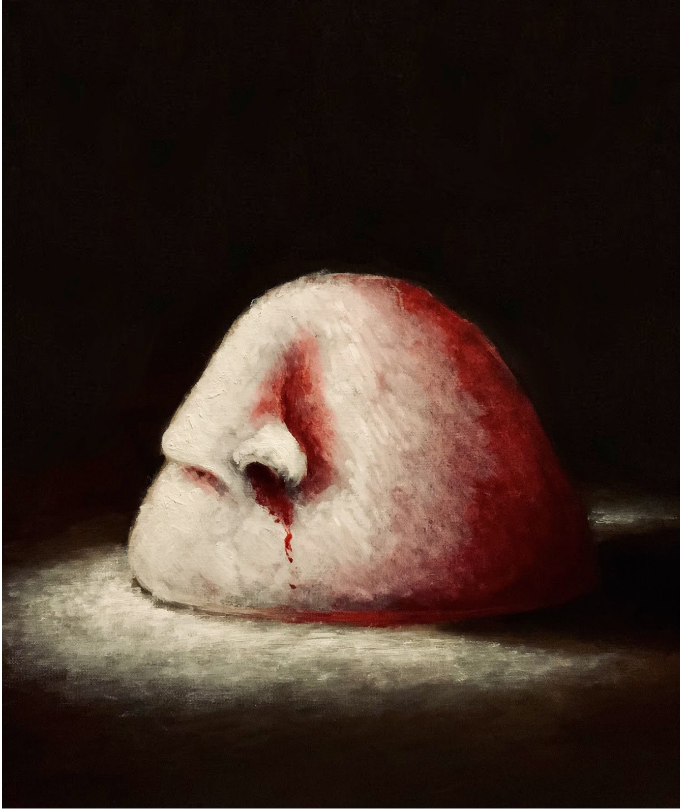
To Smell by Donald Patten